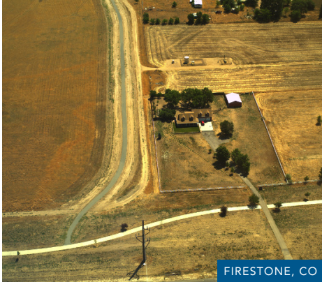
Facility: Del Camino–Rinn Valley 115kV Transmission Line Underground portion between structures 47 and 48 Owner: Tri-State