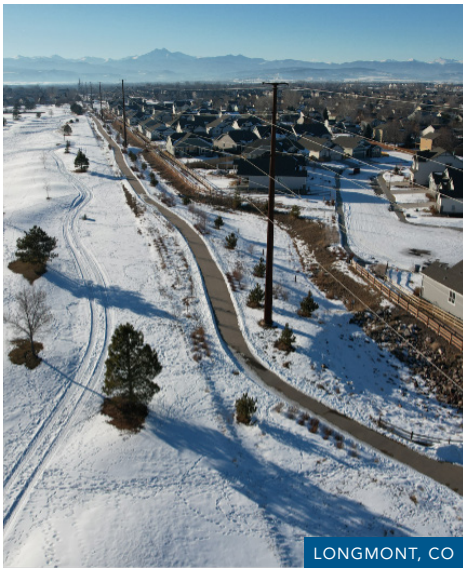
Facilities: Del Camino Tap-Meadow 115kV & Fordhan-Fort Saint Vrain 230kV Transmission Lines

Owner: Public Service Company of Colorado