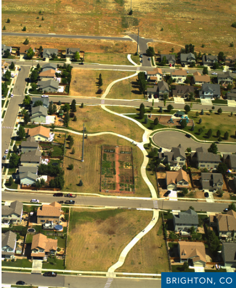
Facility: Bromley–Henry Lake 115kV Transmission Line Owner: Tri-State

On April 13, 2022, Governor Jared Polis signed HB 22-1104 which requires all transmission providers (i.e., Tri-State) to develop, maintain, and distribute informational resources to encourage, facilitate, and streamline the construction of new powerline trails in transmission corridors that are suitable for the construction and maintenance of a powerline trail.