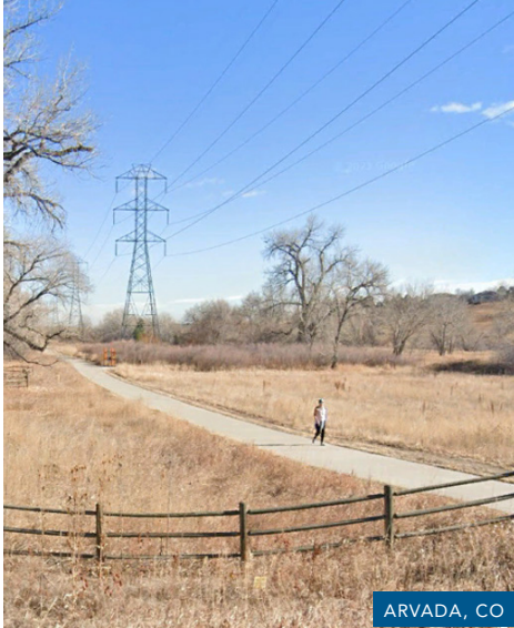
Facility: Tap-Ridge and Lookout-Ridge 230kV Transmission Line

Owner: Public Service Company of Colorado