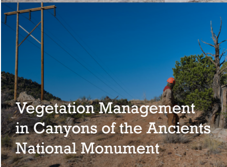
Vegetation Management in Canyons of the Ancients National Monument