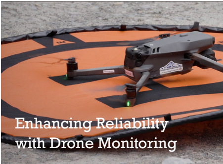
Enhancing Reliability with Drone Monitoring

Our crews average 3,500+ man-hours each year performing vegetation management projects and tree removal across more than 200,000 sq miles of our service territory to enhance the safety for all of our communities.