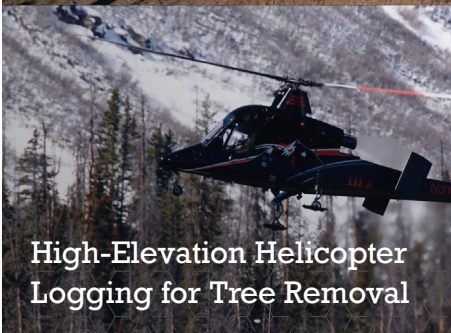
High-Elevation Helicopter Logging for Tree Removal