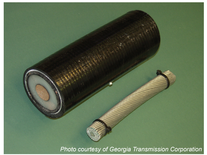
Thick underground cable next to smaller overhead conductor

There are currently two cable types that could be used in a high-voltage underground option. One is a cross-linked polyethylene (XLPE) system and the other is a highpressure fluid filled (HPFF) system. Both systems require