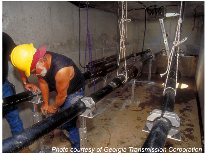
Working on underground lines in typical 8x8x24 foot manhole

Information About Undergrounding High-Voltage Transmission Lines