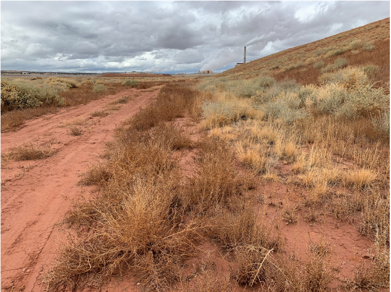
Photograph 4: Typical Embankment Toe Condition

The embankment toe was observed to be in good condition. Signs of seepage, such as springs or boggy areas, were not observed along the embankment toe. The typical condition of the embankment toe is depicted in Photograph 4.