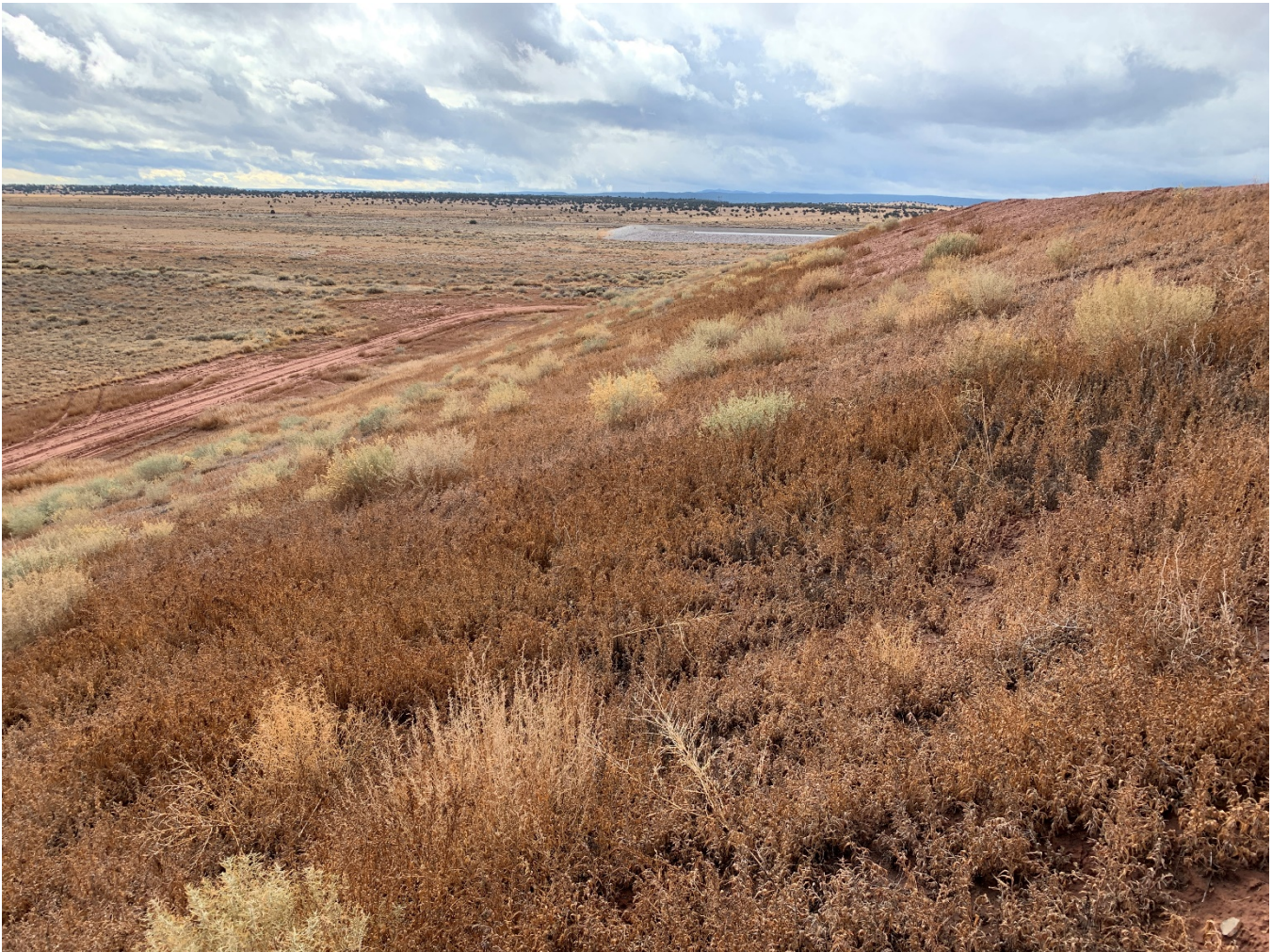
Photograph 3: Typical Embankment Slope Condition

Native vegetation is being established on the embankment slopes, but establishment of a mature vegetative community is challenging given the climatic conditions at the site. Unusually poor or thriving vegetative growth was not observed on the embankment slopes, but there was generally less vegetative coverage on the south embankment slope than on the east embankment slope due to the southern aspect. No trees or woody vegetation were observed on the embankment slopes. No evidence of recent animal burrowing was observed on the embankment slopes. The typical condition of the embankment slopes is depicted in Photograph 3.