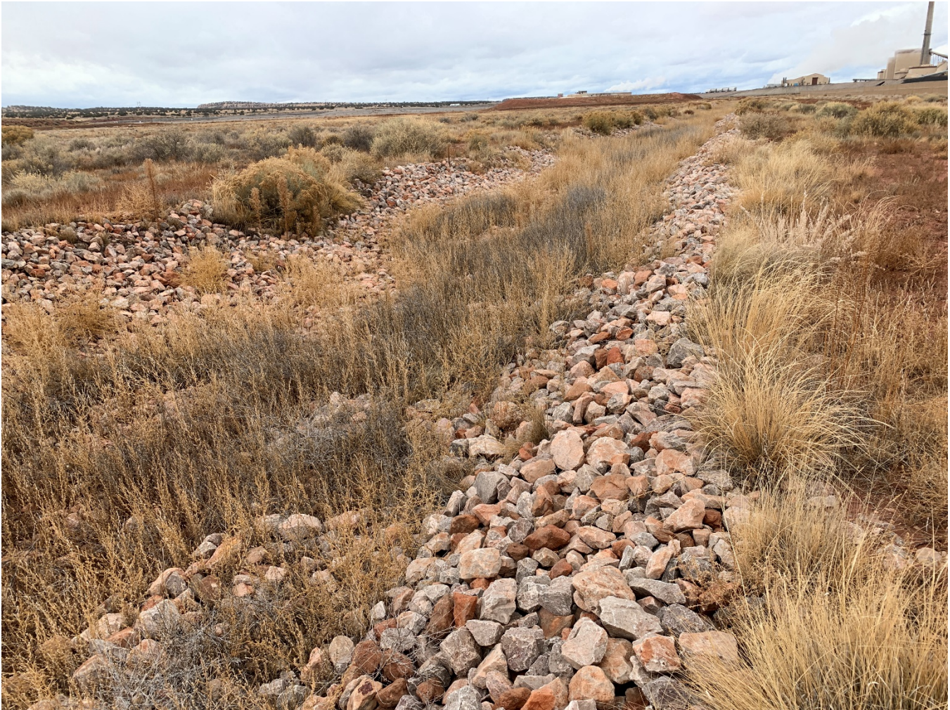
Photograph 5: Typical Storm Water Channel Condition

The storm water control features at the facility were observed to be in good condition. At the time of the visual observation, the only permanent storm water control feature at the facility was a run-on control channel that is designed to convey storm water from west to east along the south end of the facility. The run-on control channel is armored with riprap. Relatively large shrubs were observed to be growing in the flow path. The shrubs do not pose a threat to structural stability, but they should be removed periodically to help maintain the channel's flow capacity. The typical condition of the run-on control channel is depicted in Photograph 5.