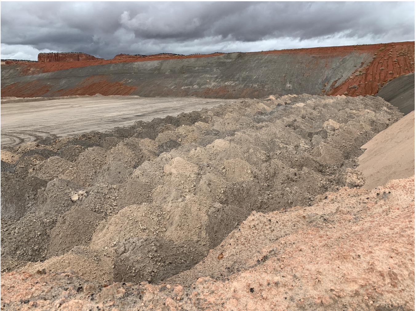
Photograph 1: Typical Deposition Area Condition

The deposition area was observed to be in good condition. Signs of ground movement, such as sloughing or sliding, cracking, subsidence, or bulging, were not observed in the deposition area. Deposition of CCRs was not occurring at the time of the visual observation. However, the deposition methodology appeared to be appropriate based on observation of the deposition area. Appropriate grading had been established to collect contact water within the deposition area. A berm that was several feet in height was in place around the perimeter of the deposition area to prevent migration of contact water out of the deposition area. Fugitive dust was not observed at the time of the visual observation. The typical condition of the deposition area is depicted in Photograph 1.