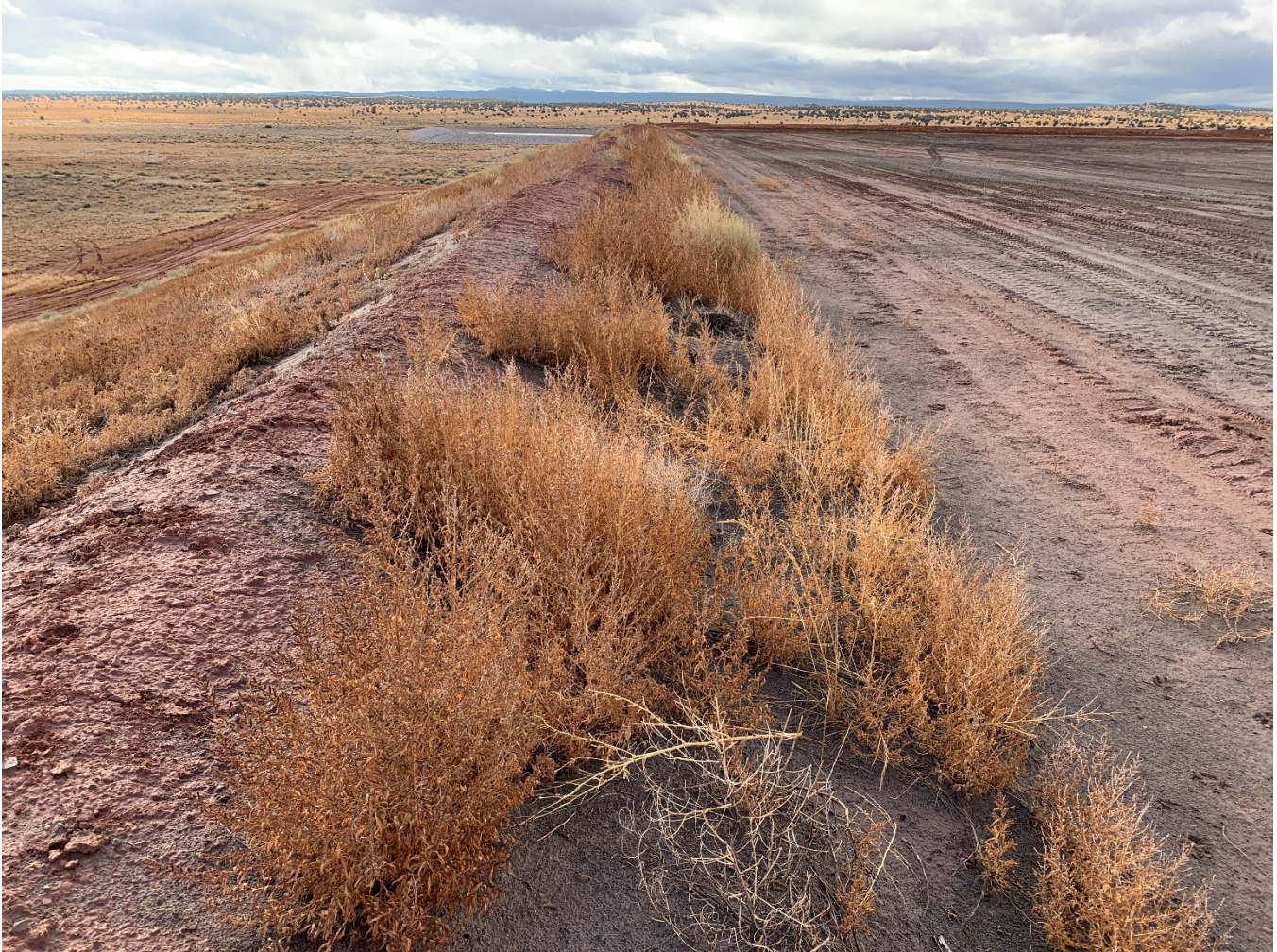
Photograph 2: Typical Embankment Crest Condition

The embankment crest was observed to be in good condition. Cracking that would be indicative of ground movement was not observed along the embankment crest. Low areas that would be indicative of differential settlement were not observed along the embankment crest. The typical condition of the embankment crest is depicted in Photograph 2.