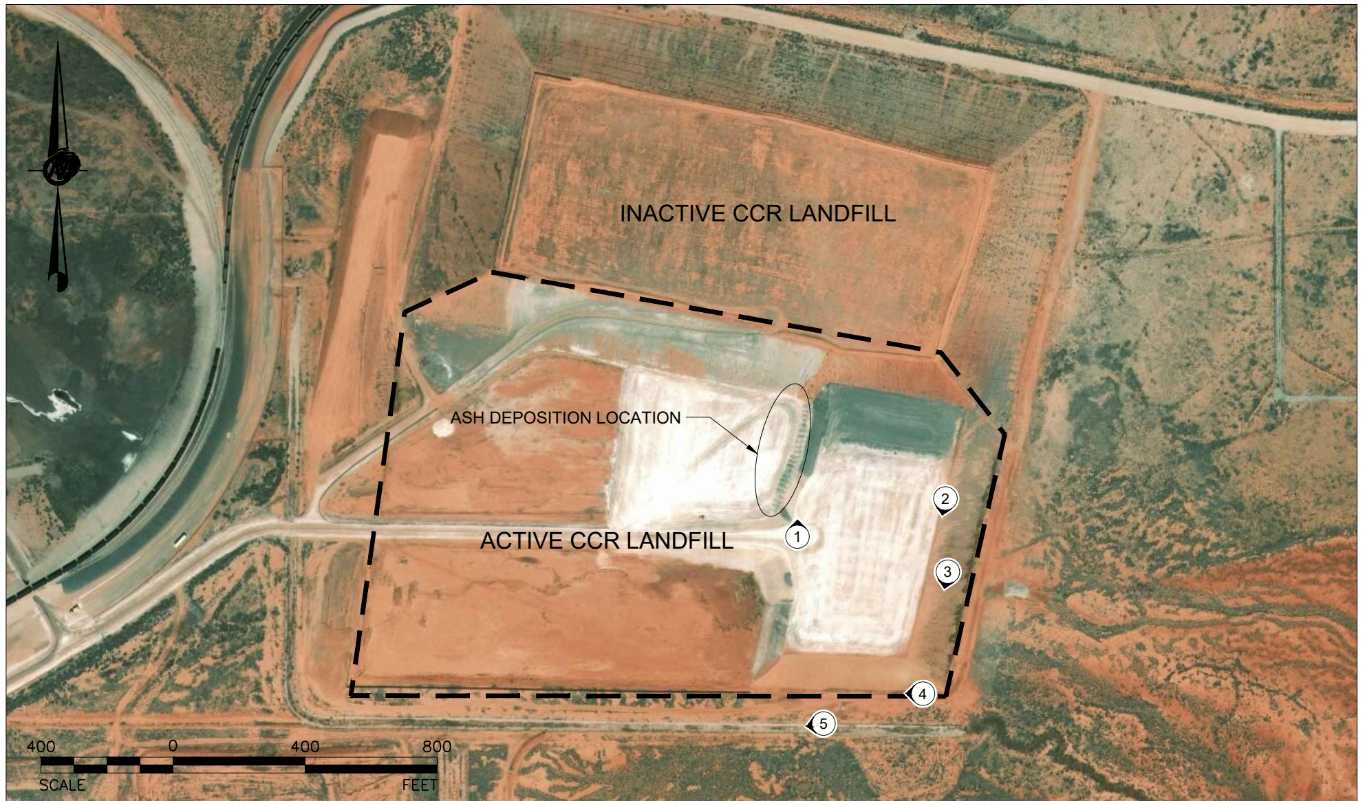
Imagery captured May 2018.